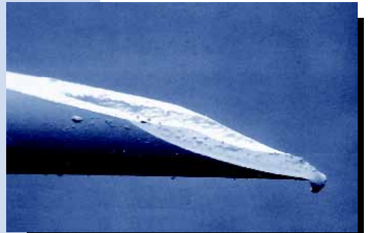
Needle point, used twice

Use a brand new syringe EVERY TIME you poke your skin or vein.