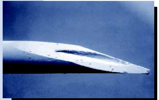
Needle point, used once