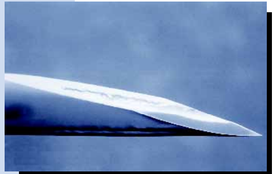
New needle point